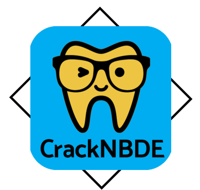
UNLIMITED ACCESS ON ALL DEVICES