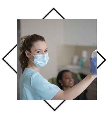
INBDE PASS GUARANTEE