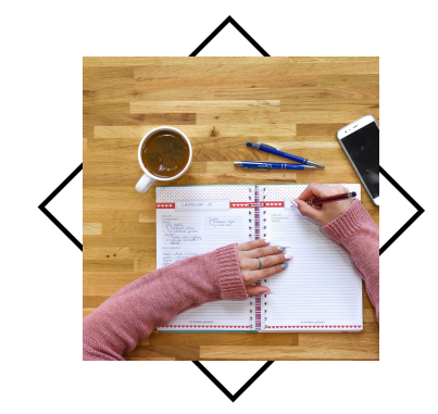
CONTENT CONSTANTLY UPDATED